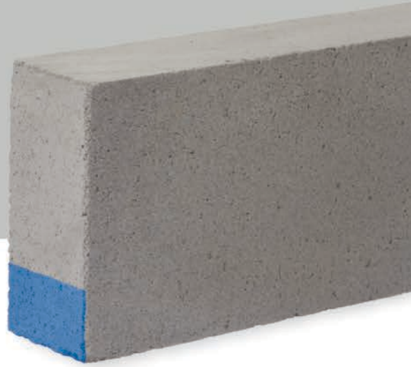
Solar Grade (blue)

Solar Grade is principally used where enhanced thermal performance is required.