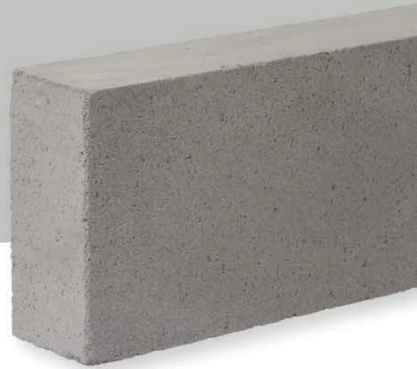
Standard Grade (no colour line)

Standard Grade is extremely versatile and can be used below DPC, as infill for beam and block flooring systems, as well as above the ground in the walling applications listed.