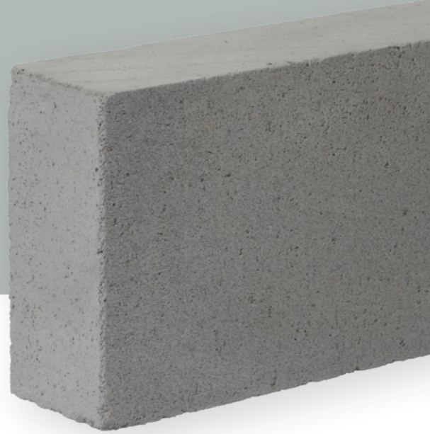
Standard Grade (no colour line)

Standard Grade is extremely versatile and can be used below DPC, as infill for beam and block flooring systems, as well as above the ground in the walling applications listed.