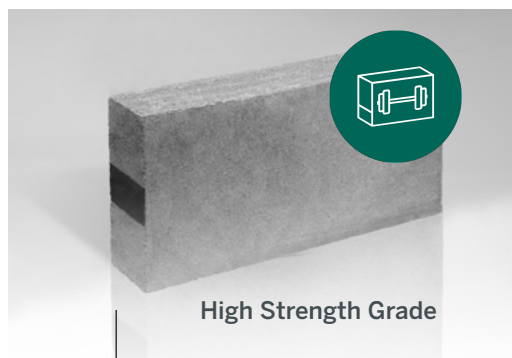
High Strength Grade